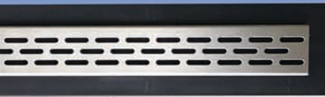
Oval Style Grate