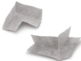
Composeal Grey 20 mil PE Corners