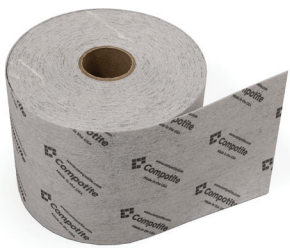
Composeal Grey 20 mil PE Seam Tape